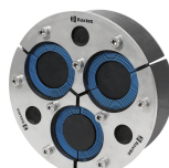
H3 UG™ seal

For detailed information, please visit roxtec.com .